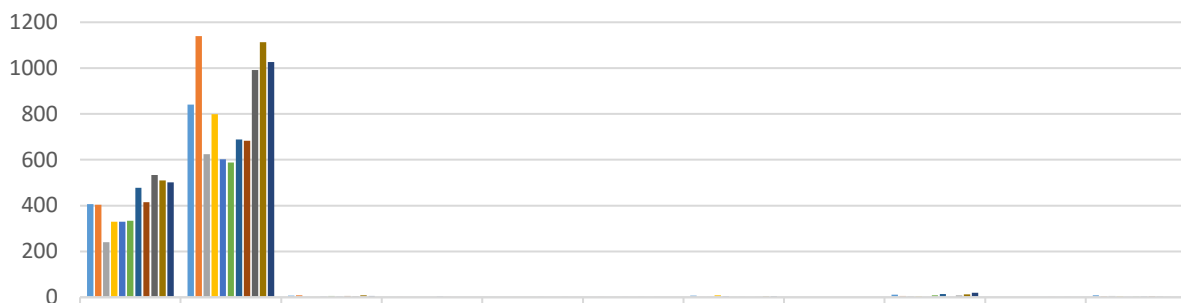
Most frequently reported cases during epid week 22-2025 to 32- 2025